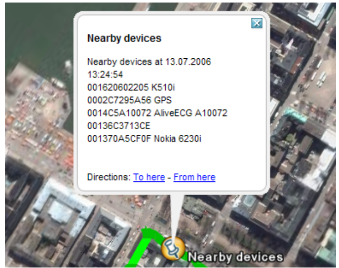
Figure 4: Using Google Earth to visualize (a) movements of the user and (b) Bluetooth proximity information