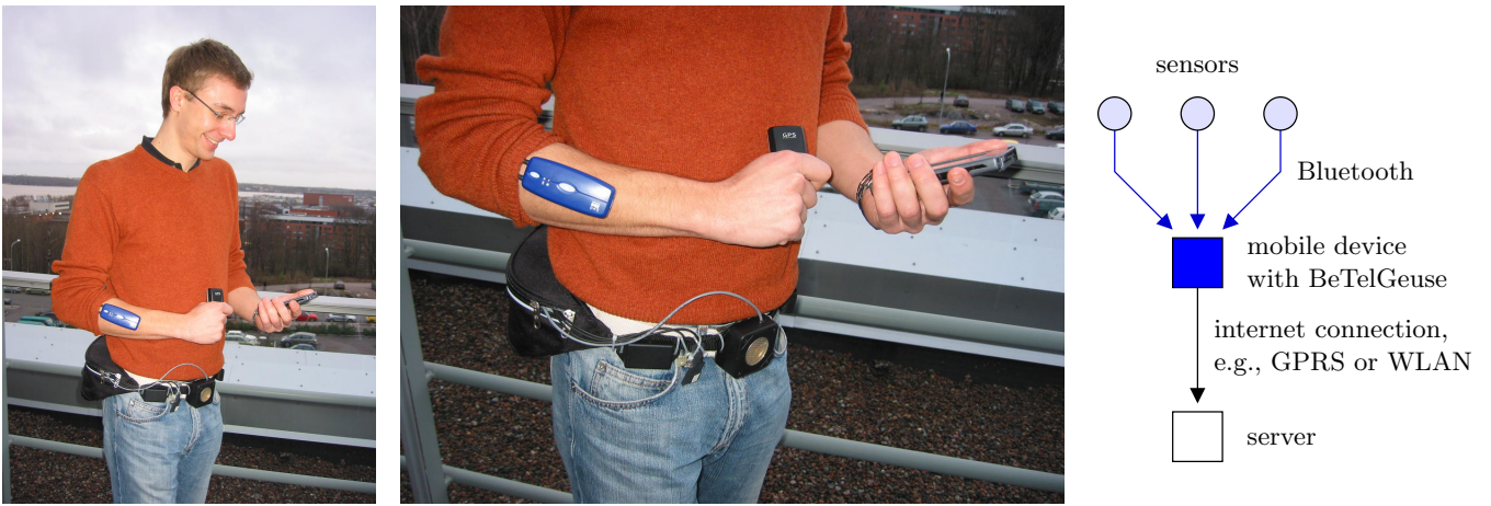
Figure 1: Using BeTelGeuse. Our subject carries a PDA device which runs BeTelGeuse. BeTelGeuse gathers data from the following Bluetooth devices: a GPS device (in the right hand), Alive Heart Monitor (attached to the right arm) and I-CubeX sensor system (on the waist, from left to right: the controller and an orientation sensor in the bag; a 3D acceleration sensor, an ambient light sensor, a temperature and humidity sensor, and an ultrasound distance sensor attached to the belt). See Table 1 for more information on the sensors.