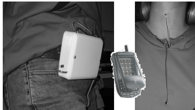
Figure 1. SenSay: sensor box mounted on the hip (left), the mobile phone (center), and voice and ambient microphones mounted on the user (right).

In a much more limited context the idea of smart appliances and phones was explored in [1], [3], [4] and [5]. In [2] concepts of context-aware computing and wearable devices have been described.