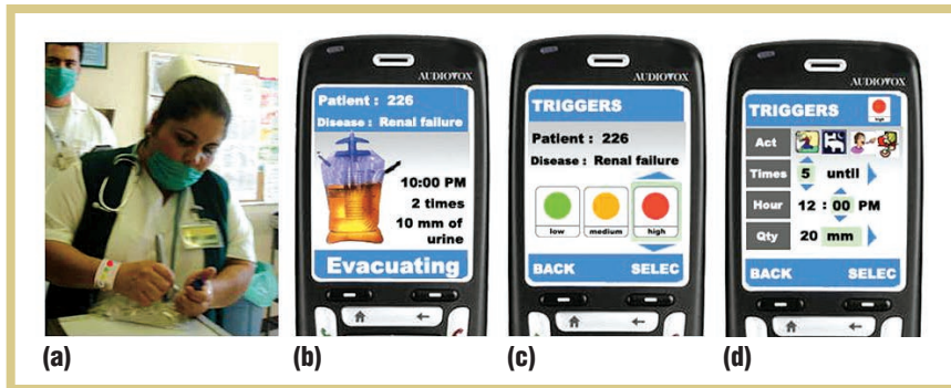
Figure 2. The mobile activity monitor. (a) A nurse uses the activity-aware bracelet; (b) the mobile activity-aware assistant shows information related to an activity being executed by a patient; (c) a nurse uses her cell phone to assign colors; and (d) a nurse associates contextual information with an activity.

manage activities during their everyday routine. To cope with this, we need to develop approaches for identifying what information to sense and the appropriate sensing technologies.