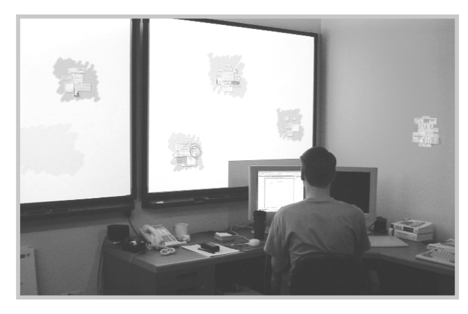
Figure 4. A montage of a working context, including a number of application windows and two external context notification cues, representing both virtual- (completion of a print job) and physical-context information (the availability of a colleague).

ties. Our system implementation incorporates existing electronic whiteboard interaction techniques with montages and notification cues. <sup>13,14</sup> This lets the user annotate montages with informal reminders and reposition montages to indicate the respective priority of background activities. Addi-